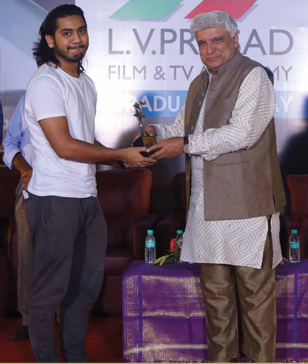
PADMA BHUSHAN JAVED AKHTAR PRESENTING THE GOLD AWARD FOR FILM DIRECTION AT THE 12TH GRADUATION DAY