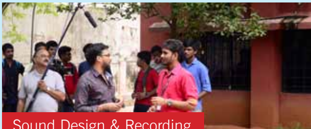
Sound Design & Recording