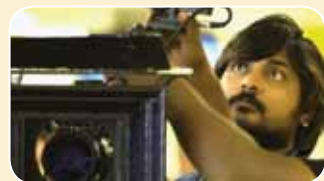
Vignesh Vasu Cinematography - Katteri, Rum