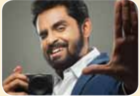
Balaji Mohan Director - Kaadhali Sodhappuvadhu Eppadi, Maari, Maari - II