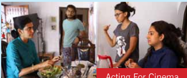
Acting For Cinema

For more details visit our website : www.prasadacademy.com/full-time-courses