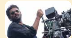
Advaita Gurumurthy DoP - UTum, Gaalipata 2, Kavaludaari, Kirrak Party, Churikkatte