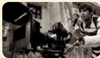
Sujeeth Director - Run Raja Run, Saaho