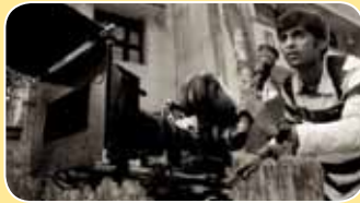
Sujeeth Director - Run Raja Run, Saaho