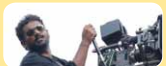
Advaita Gurumurthy DoP - UTurn, Pirangipuram, Uppina Kagada, Kirrak Party