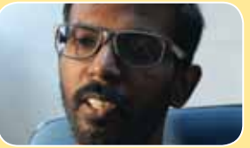
Sathyaraj Editor - Vidiyum Munn, Andhaghaaram, Super Deluxe, Rum