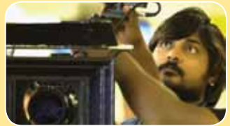
Vignesh Vasu Cinematography - Katteri, Rum